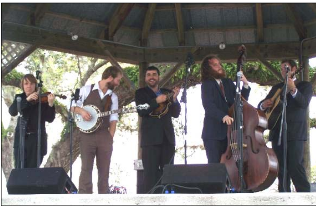
Live Entertainment at Barron Park