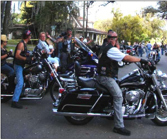
Bikers meet at the Swamp Cabbage Festival

Area car and motorcycle clubs would attract interest from local enthusiasts by holding shows in Downtown LaBelle.