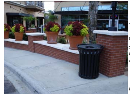
Seating Encourages Street Activity

projects are to establish a pilot streetscape program, create identification and signage that sets the downtown apart as a special place, create a veterans’ memorial park, and implement the wharf grant.