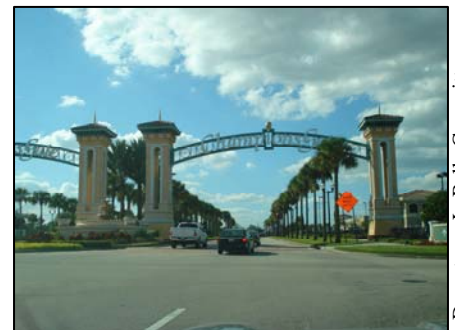
Special gateway features establish the entrance to the downtown

As mentioned previously, with the establishment of a separate logo, and as a part of the effort to give the downtown core its own identity, it is recommended that signage with a unique character and design be developed for wayfinding and for markers within this area.