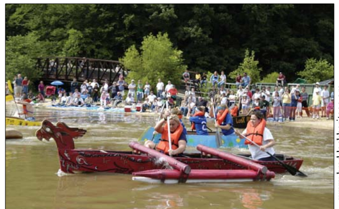
Cardboard Boat Races

River-based entertainment, such as fishing contests, water ski shows or boat shows would also encourage people to come downtown.